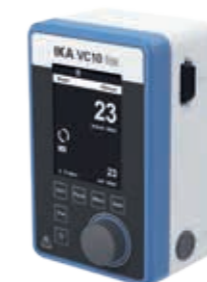
VC 10 pro Ident. No. 0020112031

Compatible only with VACSTAR digital, cable connection with vacuum pump is required.