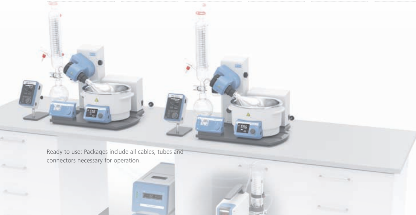
Ready to use: Packages include all cables, tubes and connectors necessary for operation.